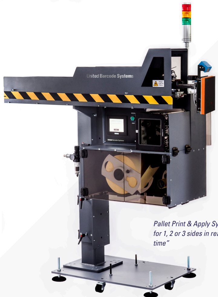
Pallet Print & Apply System for 1, 2 or 3 sides in real time"